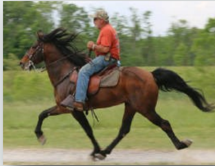
Rowdy Rawhide's Rocket