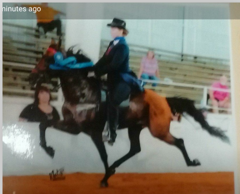
Fleet's Mad Max