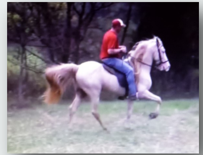
EZD's Danger's Ace