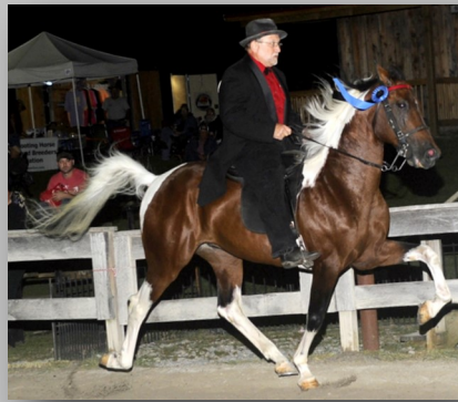
Piper's Scootin Scooter

Stud Fee: $350 Kennedy Stables Wes Kennedy 2852 Franklin Gaynor Road Hawesville, KY 207-314-7442 WesRK85@gmail.com