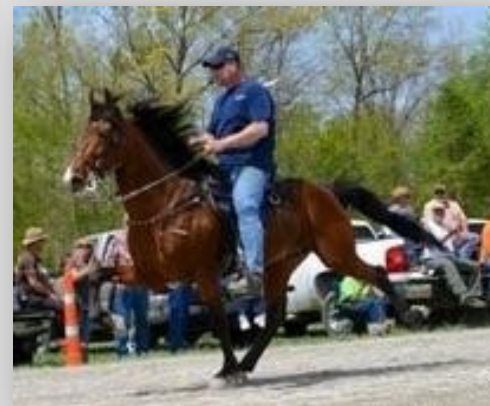
Reverend Homer's Deacon

2014 Ultimate Single-Footing Horse Champion.