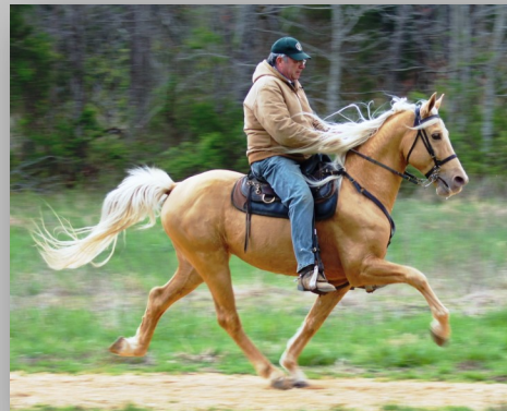
Golden Eclipse Rock